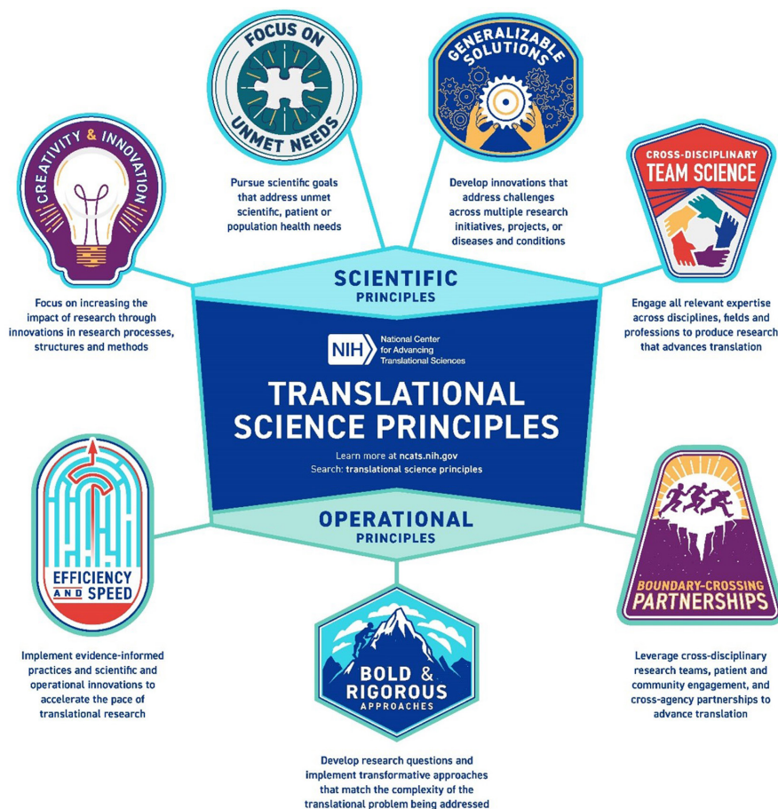
FIGURE 1 Summary graphic of translational science principles with brief titles and descriptions.

made the course syllabus, required readings, glossary, and evaluation instruments available, with the goal to disseminate these broadly so others will be able to adapt them for their own education activities.